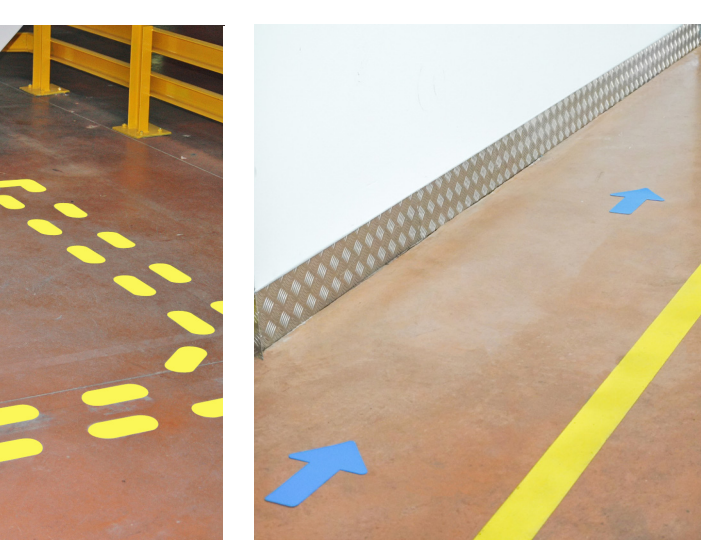
Article R 4224-9 of the Employment Legislation : Indoor and outdoor workplaces must be organized in such a way that pedestrians

30 pieces per box. Possible combination of boxes of different colors.